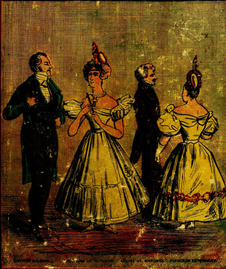
GEORGE BURNING THE KING OF RUTLAND COUNT ST. ANTONIO PRINCESS BETHARAZ